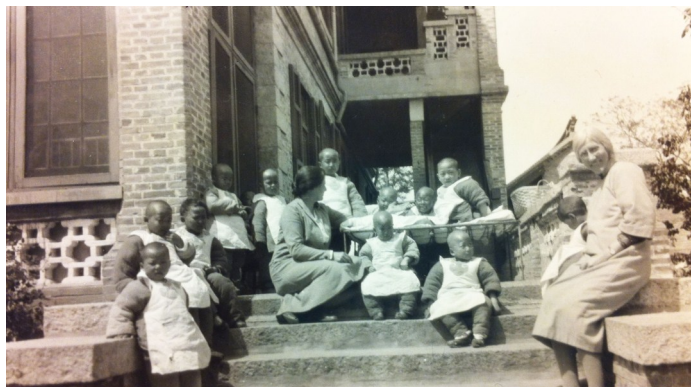
“Children at the Women’s Hospital Hwei yuan.” From the Laymen’s Foreign Missionary Inquiry, Series 1B, Box 5, Folder 10

Much of the history of the introduction of Western Medicine into China is to be found in Missionary collections across the USA rather than in China; the Burke's Missionary Research Library holdings are a key source for the project. The project aims to provide an online database of information listing Chinese hospitals and medical colleges, with the libraries where more detailed sources on their history are to be found. Researchers will be able to identify and request access to these sources through online archival finding aids and subject guides.