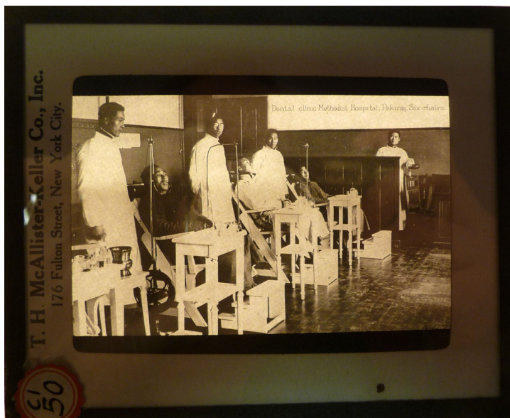
Peking Methodist Hospital Dental Clinic MRL6: Lantern Slides

The final part of this project in the future will digitize selected primary source documents. It is planned to digitize some 135 newly-discovered photographic glass lantern slides showing medical and premedical schools in China, and Chinese hospitals with interior and exterior views.