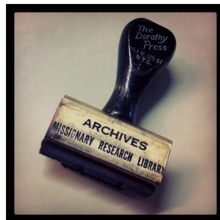
MRL Stamp—No Longer In Use