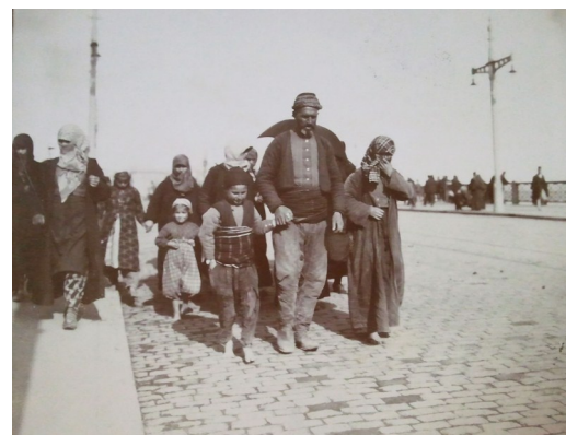
MRL 2: American Constantinople Relief Committee Records, series 1, box 1, folder 10