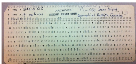
MRL 12: Clarence R. Thayer Papers, series 3, box 7

Rheinische Missionsgesellschaft Reports, 1897-1912 – Reports from the Rheinische Missionsgesellschaft (Rhenish Missionary Society), 1897-1912 detailing Southern Africa, with some information on missionaries in Borneo, China, Batakland/Sumatra, Nias and New Guinea. Copies of handwritten and typed originals in German.