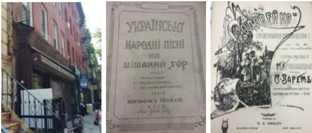
Surma's East 7 th Street location; Two examples of early sheet music from the Surmach Collection.