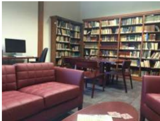
Room 713 Hamilton Hall