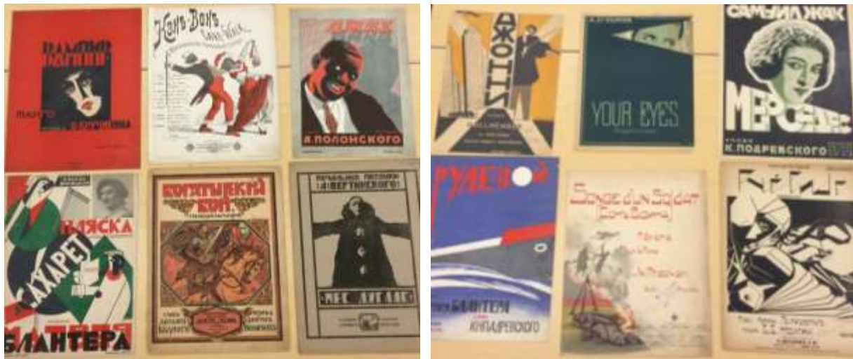
Sampling of sheet music covers from the latest purchase.

One of the most visually exciting additions to Columbia's holdings was the purchase of ninety-five additional examples of late Imperial and early Soviet sheet music. Columbia's holdings, catalogued collectively at https://clio.columbia.edu/catalog/10290450 are quite likely the largest in any North American collection from this era, now including some 268 titles.