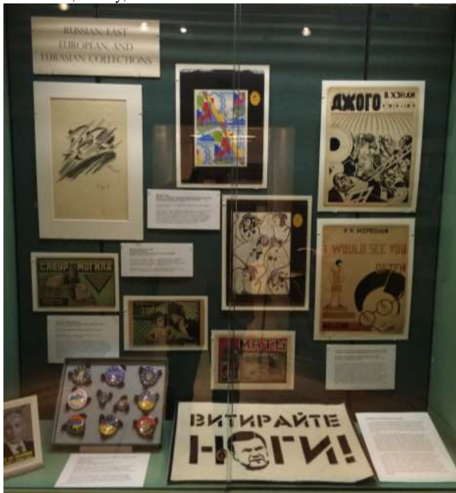
The Russian, East European and Eurasian Section of the Exhibit

Since the early 20 th century, the Slavic and East European collections of the Columbia University Libraries have actively collected such materials—dating back to at least 1906, when a large cache of illustrated Russian satirical journals were acquired. The tradition continues today, as witness the small and diverse sampling of recent purchases that were on display. It is hoped that such materials will continue to serve as intellectual grist for the research of present and future generations of students, faculty, and scholars.