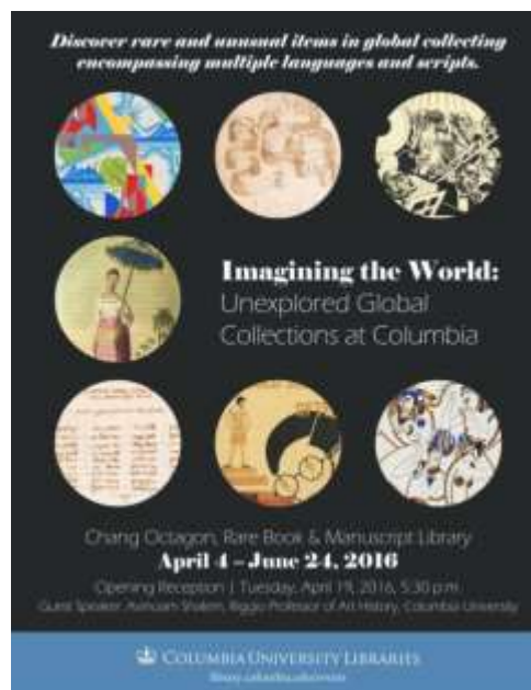
Exhibition poster, featuring as design elements vignettes from four of the Eastern European items on display (top right, top left, bottom center and bottom right)

From April 4-June 24, 2016, the Chang Room of Columbia's Rare Book & Manuscript Library hosted an exhibit organized by the librarians of the Global Studies Division showcasing a diverse array of rare and unusual materials from Columbia's holdings pertaining to the cultures and languages of our respective world areas: Latin America & Iberia; Sub-Saharan Africa; the