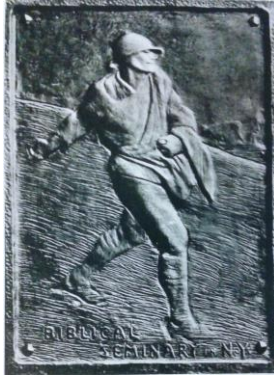
Plaque from Biblical Seminary New York, circa 1902.

Original Finding Aid: Julie Kind, Asbury Theological Seminary, 1987 Revised with updates by Ruth Tonkiss Cameron 2014