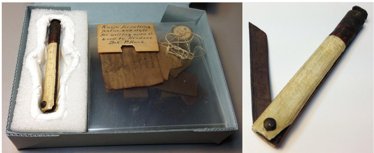
Preserved collection and stylus including knife.